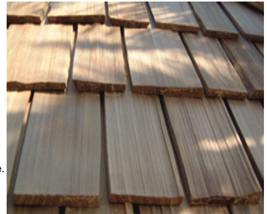
Sold by the sq (5 bundles per/sq)