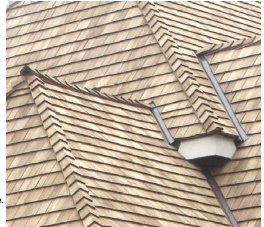
Sold by the sq (5 bundles per/sq)