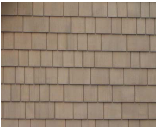
Sold by the box