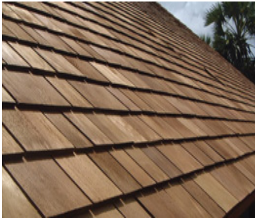
Sold by the sq (4 bundles per/sq)